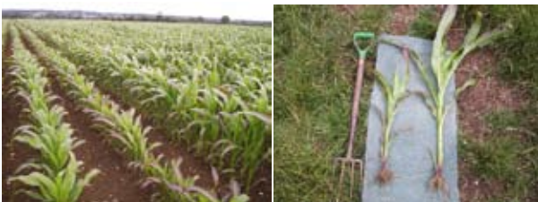
The difference continues to show at later growth stages.