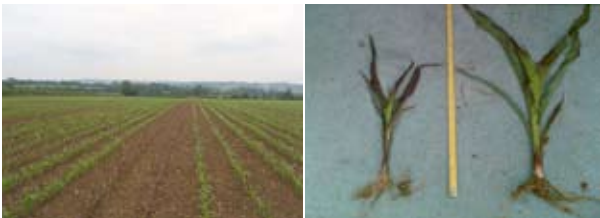
Untreated rows show clearly and plants are much smaller.

The effects of using Umostart are easy to see: